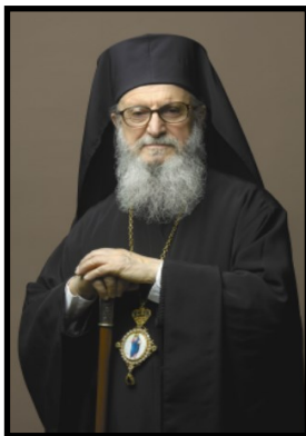
His Eminence Archbishop Demetrios Primate Greek Orthodox Church in America