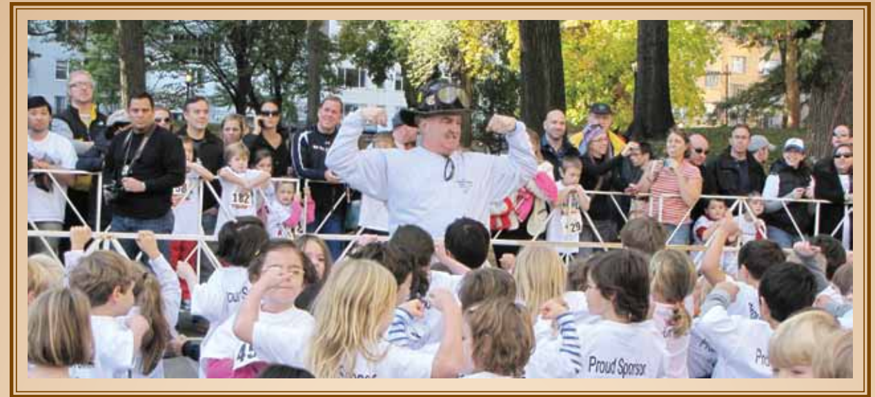
During the November Kid's Fun Run, NYC's school children came together to help kids their age who are battling cancer.