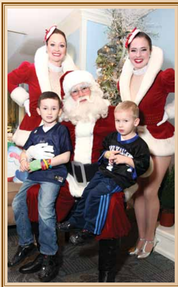
The legendary Radio City Music Hall Rockettes and Santa were among the neighbors who helped to celebrate the holidays with our families.