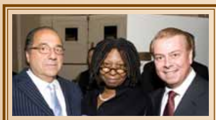
Gala emcee Whoopi Goldberg showcased her many talents in support of kids battling cancer.