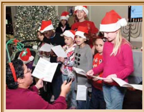
Our "Share a Night" house lighting ceremony invited the local community to celebrate a season of hope, peace and faith.