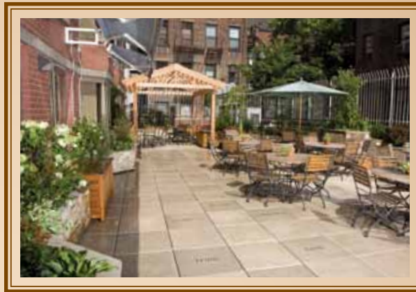
The "Jon Shevell Lawrence Third Floor Terrace" provides a modern play space and entertainment area for families and community groups during the warmer months.

All of these things lend to a strong commitment by our House volunteers, staff and the community at-large to provide families with a clean, safe environment that encourages healing.