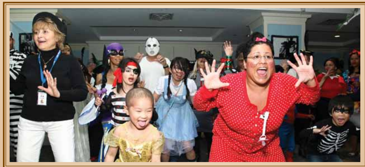
Our families had a "Thriller" of a time during the Children's Happy Faces Foundation Halloween Party.

Bonds are formed, families, staff and volunteers find new strength, and lives are changed. Its impact is immeasurable — unless you take the time to count the smiles and comforting hugs!