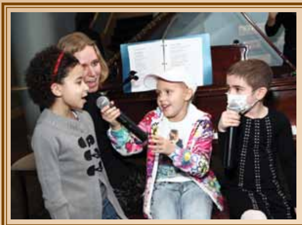
The sweet sound of music fills the hallways where music lessons with the New York Pops can only be described as uplifting.