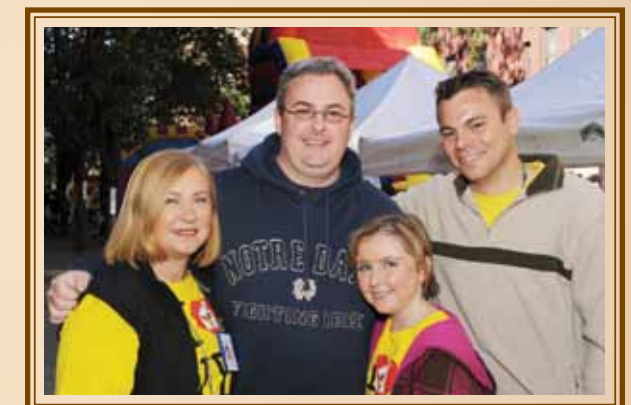
The NYPD's 19th Precinct has volunteered with the House for more than 23 years. Their service to our families has meant the world to us.