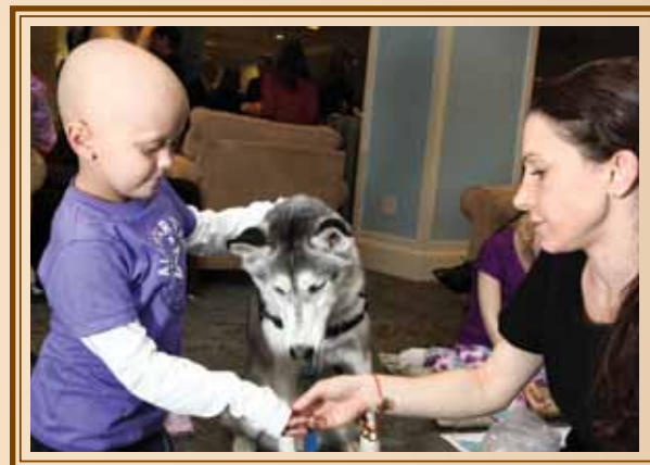
Our "Angel on a Leash" therapy dog volunteers greet families every day with a smile and a gentle touch.

healing care to parents. Through relationships with local organizations, religious and cultural observations are provided to families who request them.