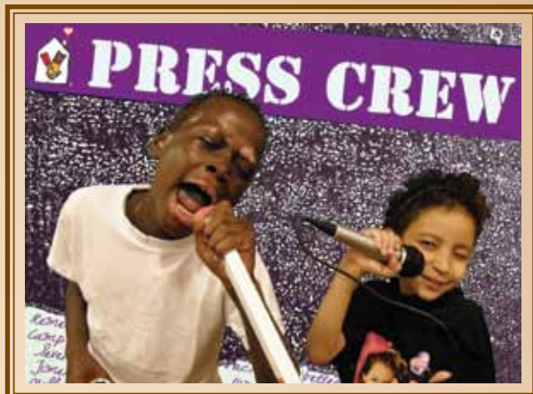
The "Press Crew" represents the latest success of our literacy program; Ronald McDonald House New York residents write and produce their own newsletter.