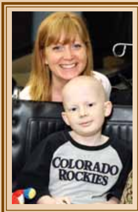
It started out as an inspired spark, and ended in an evening of magical memories that would last a lifetime. For one night the Spring Social transported families to a place where fun was the focus — and not cancer.