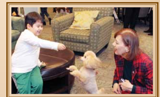
Canine volunteers round out our program with 23 teams participating in our "Angel on a Leash" therapy dog program.