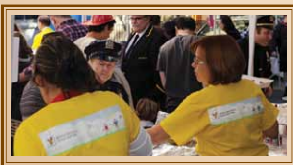
The October Block Party included an international flair thanks to the resident moms who lent a hand.